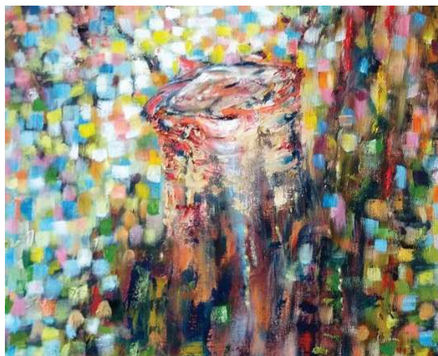
By JULIA LEONTYEV