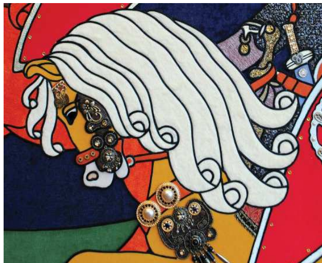
By DARIA ANGELOVA

The Exhibition Opening will take place at the Gallery on Sunday March 2 at 2 pm and it will be on display for our 'Friends' Coffee Morning the next day